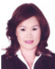
1. Eгна Ling 9455 5202 R023518D