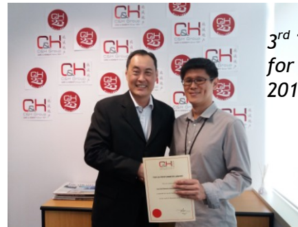
3 rd Top Producer for November 2016.

TL: With many projects TOP in the upcoming years, we may aim to obtain listings from landlords and built up long-term partnership with them.